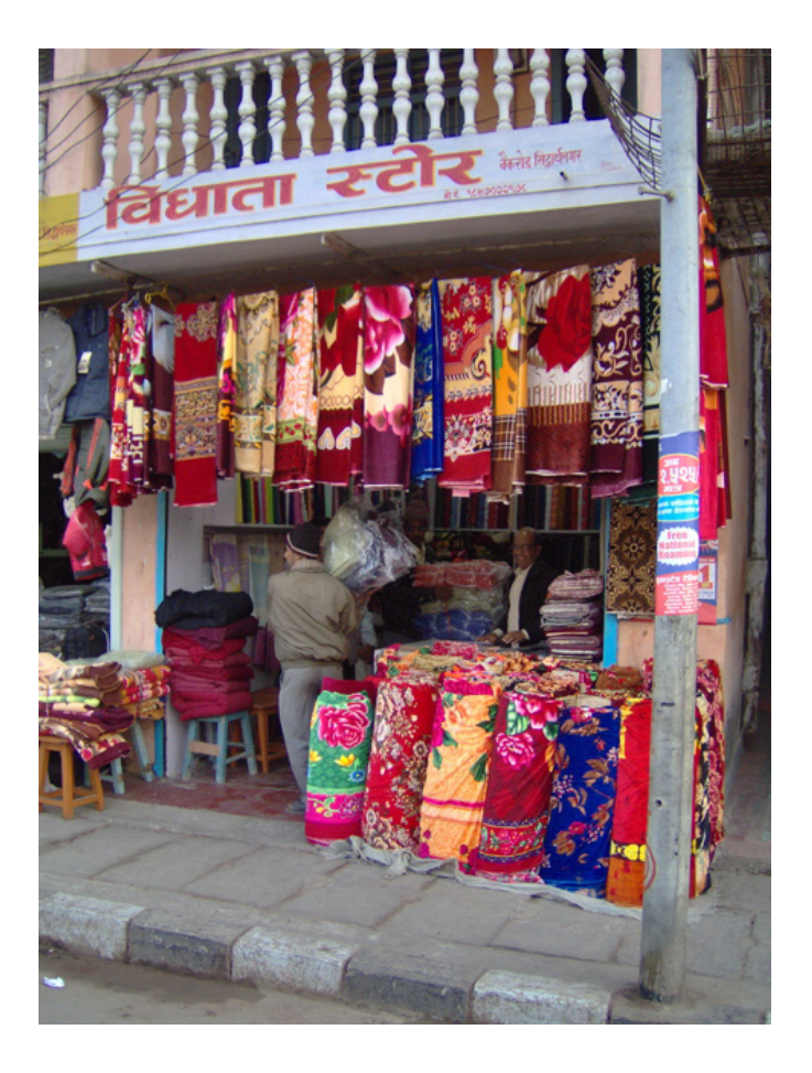
Here we are purchasing supplies. These photos show the store where I bought blankets for the children, the truck we used for hauling and the builder's supply.