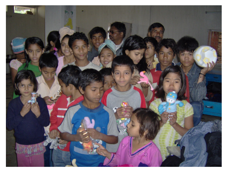
The Stewart Valley Voice

A group photo full of smiles and thank you to all those who sent gifts. The children were truly overwhelmed by the stuffed toys, little toy trucks, flashlights, and many other items. When you've never had a stuffed toy before, that moment is unforgettable.